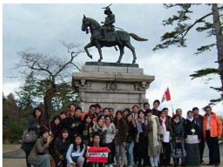
Nov 16. Field trip to the site of Sendai

The Japan-ASEAN Student Conference was held in Tokyo and Sendai from the 13 th to 19 th of November. 120 university students from the 10 ASEAN nations and 30 students selected from Japanese universities across the country came together in Sendai for the Japan-ASEAN Student Conference, the first time this event has ever been held.