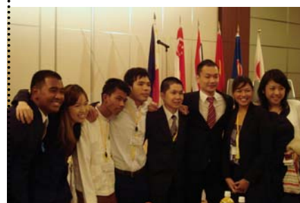
Nov 16. Friendship party held for the students and organizers.

hosts numerous other international conferences. In 2010, Japan will host APEC (Asia Pacific Economic Cooperation) related meetings and the “3rd Senior Officials Meeting” will be held in Sendai in September 15-26, 2010.