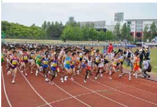
Sendai International Half Marathon

The marathon has grown in popularity and prestige over the years and has been successful in attracting both domestic and internationally renowned athletes who will compete on a course that starts from Sendai City Athletic Field and finishes in front of Sendai City Hall.