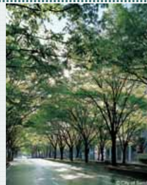
Part of the scenic course

As part of a yearly tradition, male and female runners from each of Sendai's Sister Cities are invited to participate in the half marathon. This year, Sendai will welcome runners from Sister Cities