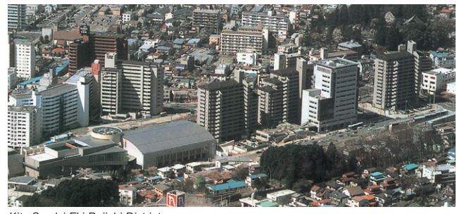
Kita-Sendai Eki Dalichi District

e.g. Chuo 1-chome District, Kita-Sendai Eki Daiichi District, Nagamachi 7-chome Nishi District