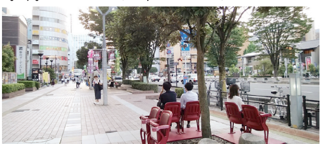
Miyagino-dori Avenue District

e.g. Miyagino-dori Avenue District, Jozenji-dori Avenue District, Aoba-dori Avenue District