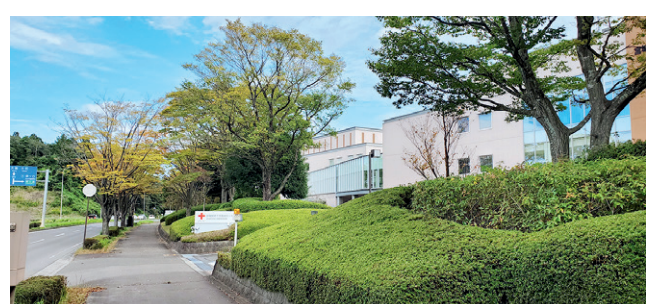
Izumi Park Town Science Park District

District Planning in Industry and Distribution Parks Plans are laid down to create industry and distribution parks full of greenery. e.g. Izumi Park Town Science Park District, Sendai Tobu Distribution Park