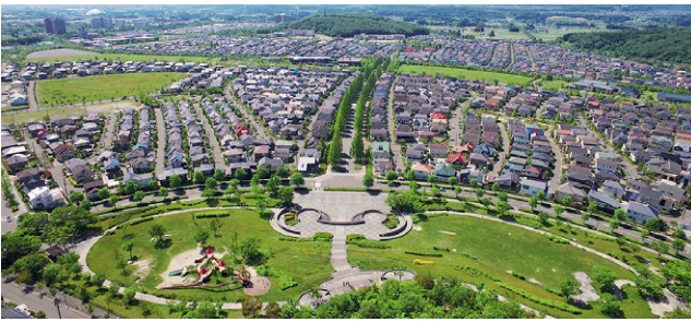
Izumi Park Town Murasakiyama District

e.g. Izumi Park Town Murasakiyama District, Senseki District, Izumi Village District