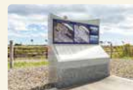
Monument 'The Memories and History of the Arahama Area'

A monument to pass down the memories and history of the Arahama area, which was devastated by the 2011 tsunami