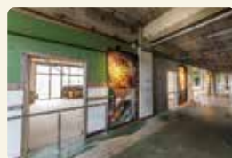
Ruins of the Great East Japan Earthquake Sendai Arahama Elementary School

Former elementary school building where 320 lives including that of children and local residents were saved from the tsunami that was triggered by the Great East Japan Earthquake. The facility is opened to the public to disseminate lessons learned from the disaster and memories of the local community.