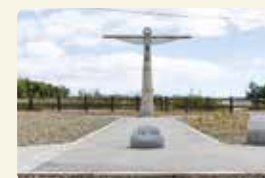
Monument 'Arahama Memorial Bell'

A monument built with the purpose of remembering Arahama and victims of the disaster