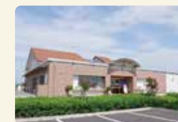
Kaigan Park Center House

General Information facility of Kaigan Park In addition to changing rooms, shower rooms and rental bicycles, this facility has halls that can be used for conducting training seminars.