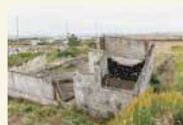
Ruins of the Great East Japan Earthquake Residential Foundation, Arahama Area of Sendai City

A facility that preserves housing foundations damaged by the tsunami. This facility shows the force of the tsunami and the daily life of residents before the disaster.