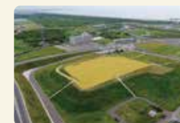
Arahama Public Square & Evacuation Hill

Public square for everyone Space containing parking lots and public toilets that also includes an evacuation hill, which serves as a place of refuge during a tsunami.