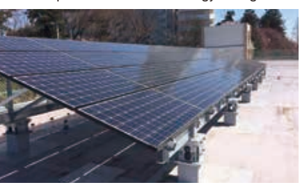
Solar panels installed on the roofs of schools and other facilities that will function as evacuation centers in disaster situations