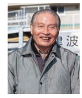
Shinetsu Hirayama Shinhama Neighborhood Association

The tsunami engulfed the Shinhama area. Some residents lost their lives and the disaster left the district covered with mud and debris. Following the tsunami, the area closer to the sea was designated as a Disaster Risk Area, although the zone that is inland from the elevated road remained available for rebuilding homes. The City of Sendai decided to build tsunami