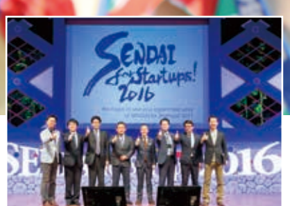
The City of Sendai and private sectors coming

Sendai is the economic center in the Tohoku region, with a population of 1.08 million people. Numerous major corporations have branches here. Many of the local companies are small/medium enterprises and have developed around a focus on the service industry. The Great East Japan Earthquake caused damage to vast numbers of facilities and equipment of private companies, caused a loss to sales channels, and a decrease in tourists, leading to serious damage to the local economy. As part of the reconstruction, administrative policy and a range of ideas and initiatives by business operators came together to revitalize the local economy.